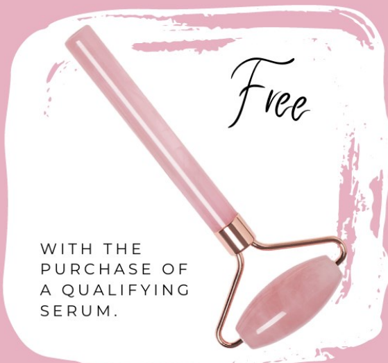
ROSE QUARTZ ROLLER