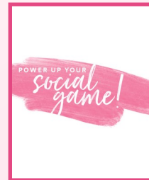
Who will be next?