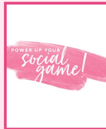
Who will be next?