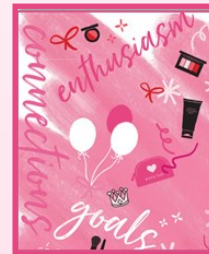
Who will be next?