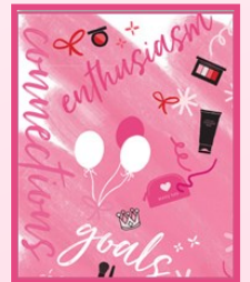
Who will be next?